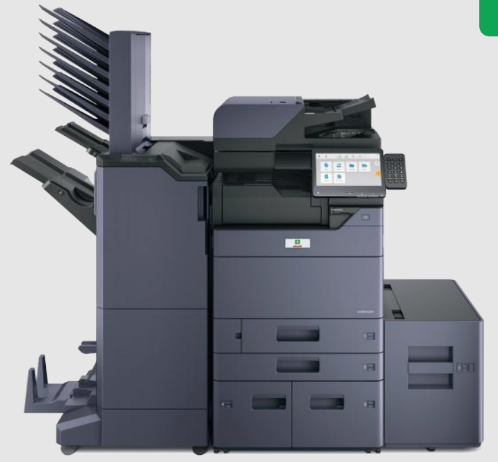
Model configured with: DP-7170; NK-7120; DF-7140; BF-730; MT-730(B); PF-7150 and PF-7120.